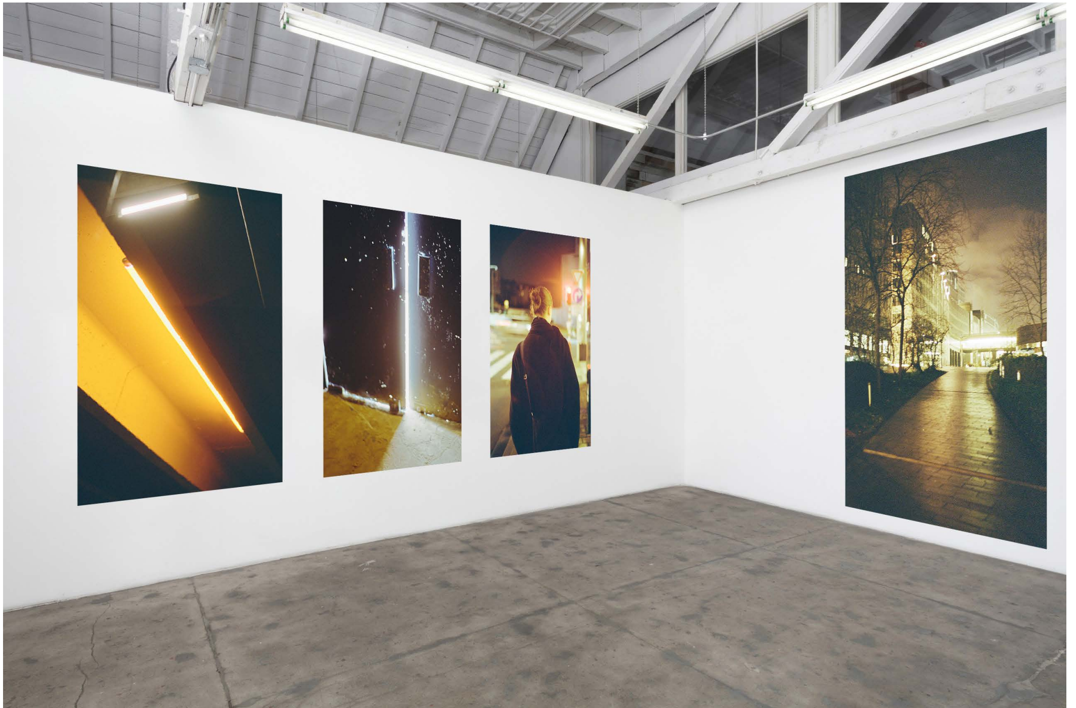
À la nuit tombée , virtual exhibition view, 2024