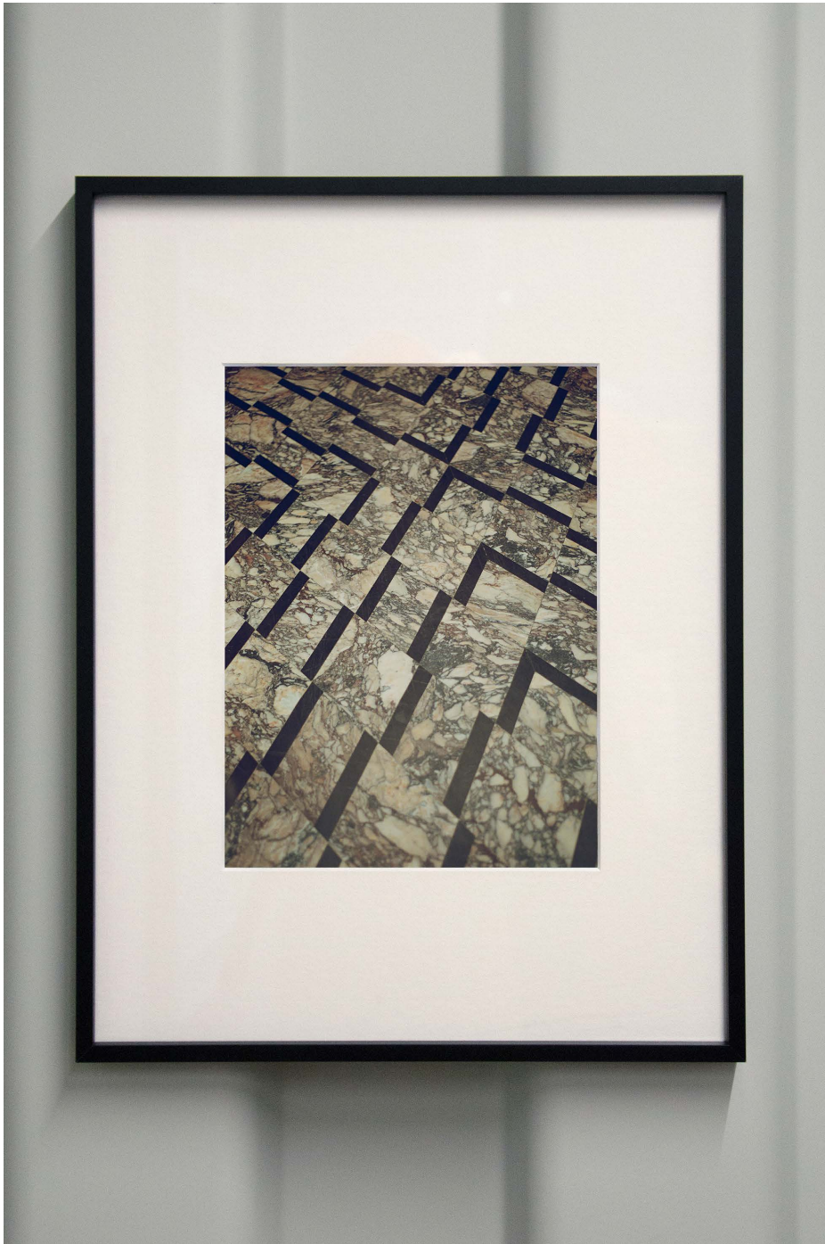
La Dérive des Roses , archival pigment print, aluminum black frame, 30 x 40 cm, ed. 3 + 2 AP