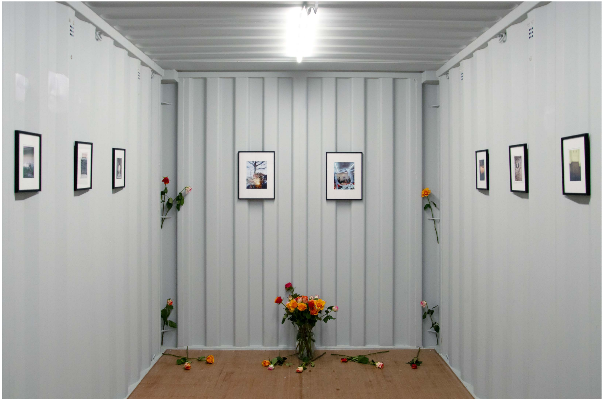
La Dérives des Roses , installation view, Rotterdam Photo Festival, 2023