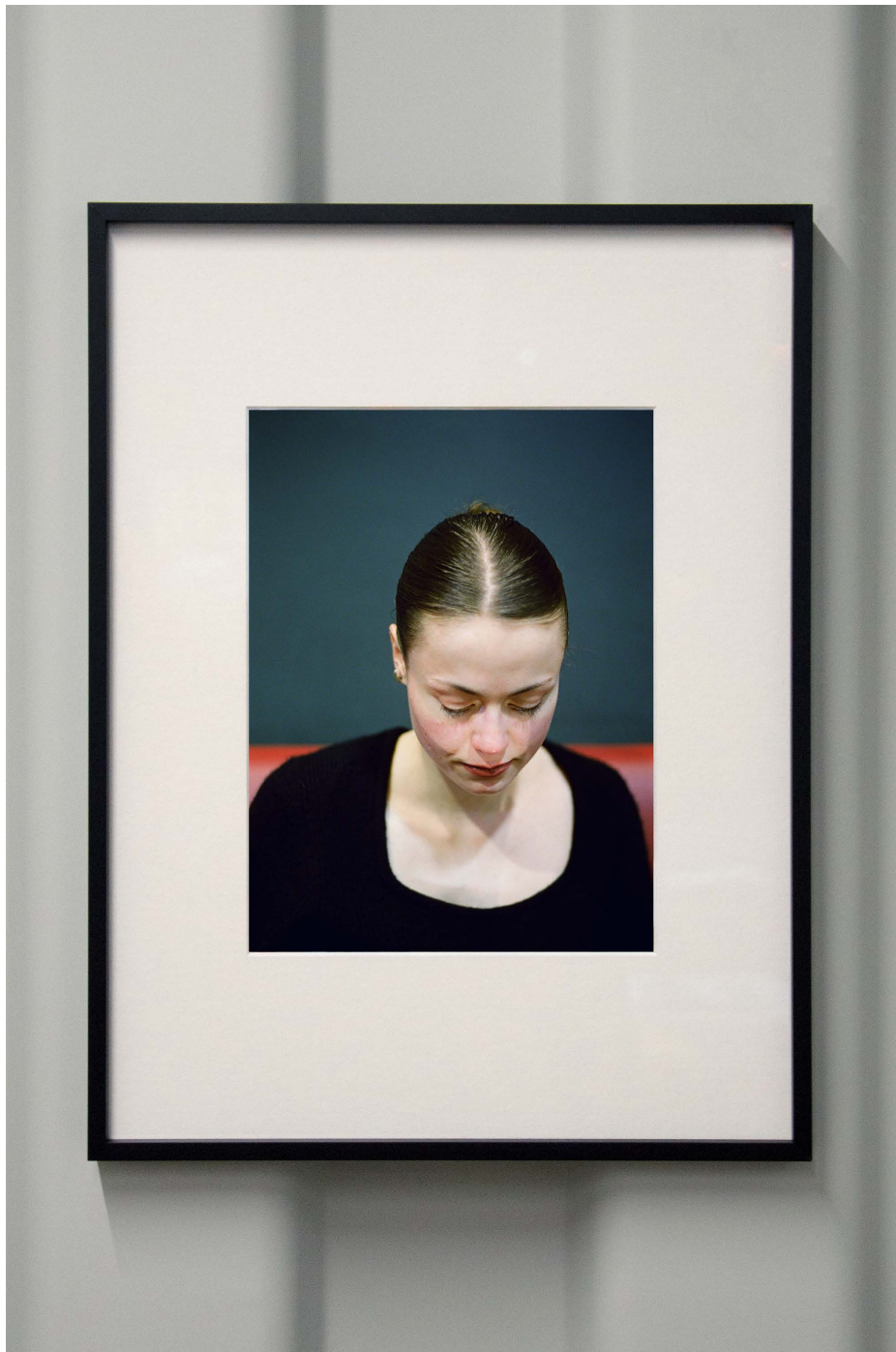
La Dérive des Roses , archival pigment print, aluminum black frame, 30 x 40 cm, ed. 3 + 2 AP