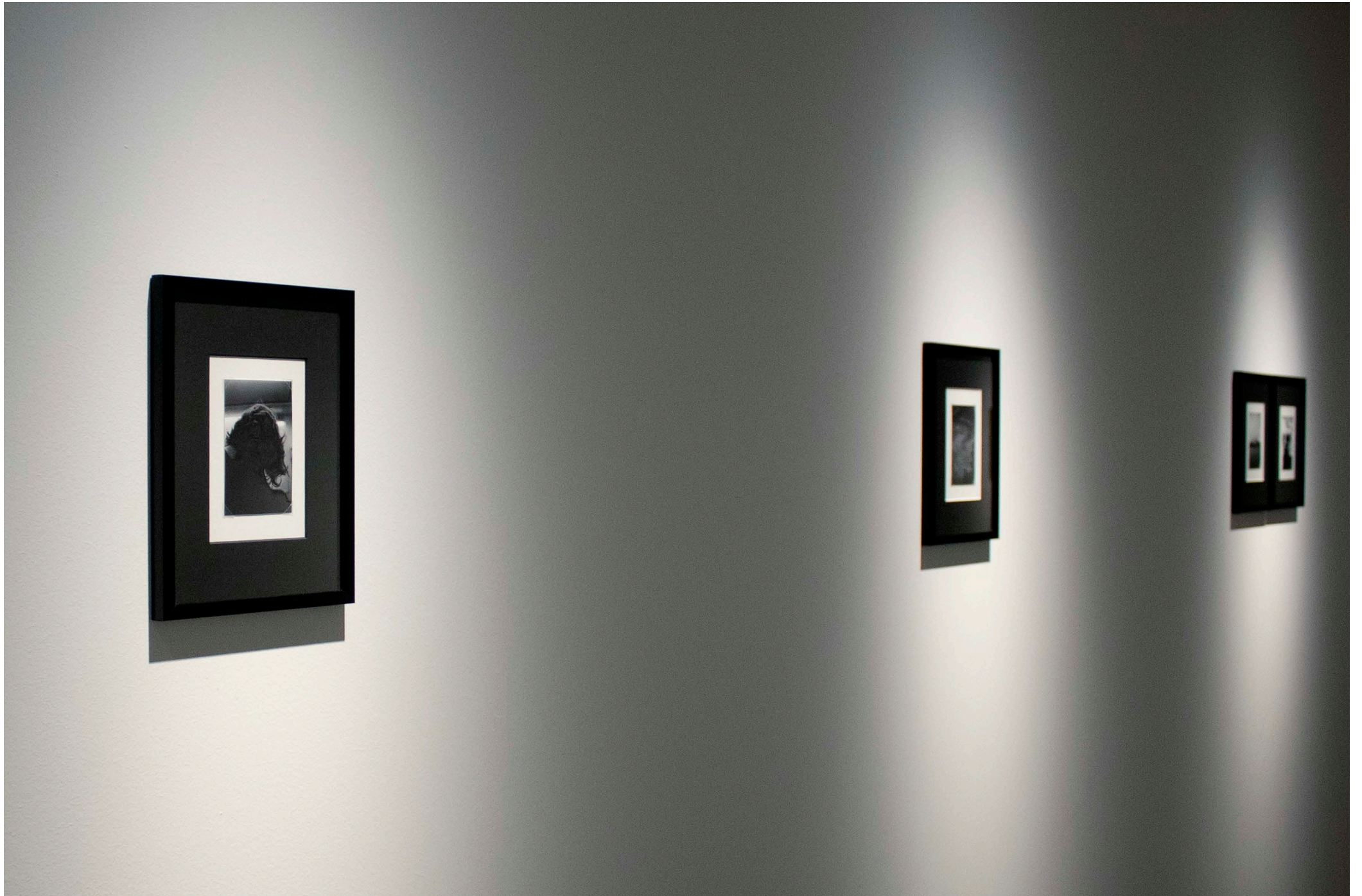
Silversalt Memories , Foreign Affairs MFA Show, Fotomuseum Antwerp, 2022