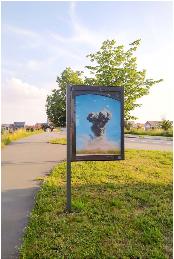
Vesuvia, OnBoards Biennale, Antwerp, 2021