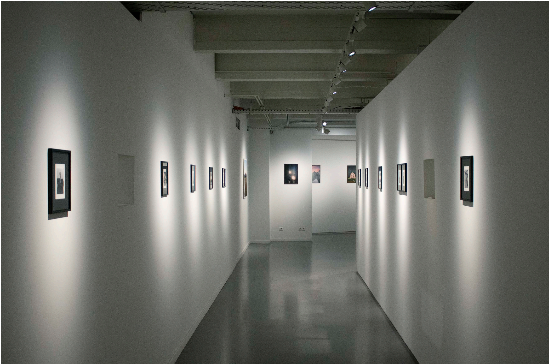
Silversalt Memories , Foreign Affairs MFA Show, Fotomuseum Antwerp, 2022